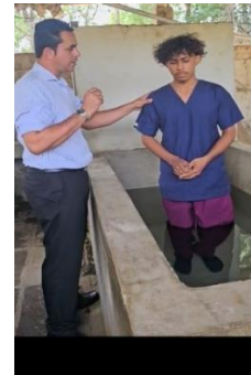
Santo Domingo Church of Christ